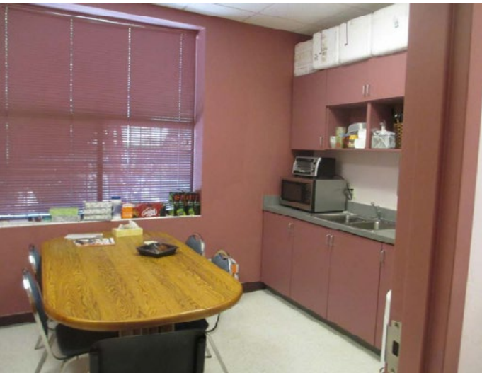
Kitchen Break Room