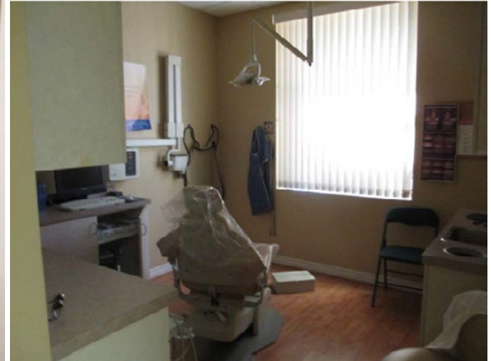
Dental Exam Room