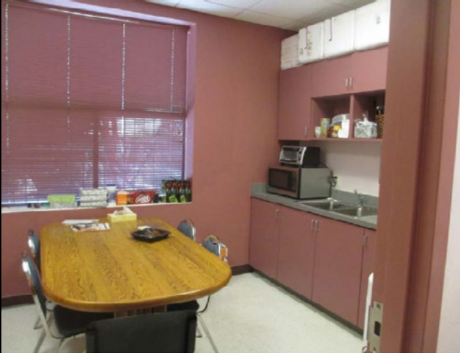
Kitchen Break Room